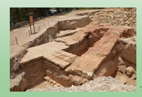
Tower A1 restored.